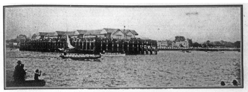
The International Boat Race, 1884. The scene off the Town Quay.

Prepared by Southampton City Libraries from Hampshire Independent 20 Sept 1884, Southampton Times 20 Sept 1884