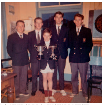
Left: NEWPORT BOATHOUSE DREESED OVERALL FOR THEIR ANNUAL REGATTA.

Below Left: A NEWPORT REGATTA PROGRAM FROM 1864 NEWPORT'S 2<sup>nd</sup> REGATTA!